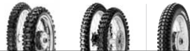
SCORPION XC MID HARD SCORPION XC MID SOFT MT 43 PRO TRIAL