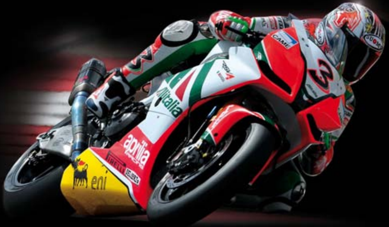
MAX BIAGGI APRILIA ALITALIA Racing 2010 FIM WSBK Champion