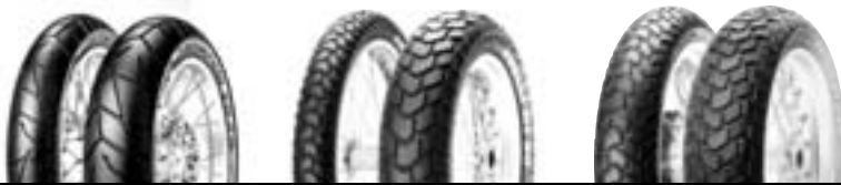
SCORPION TRAIL MT 60 MT 60 RS CORSA