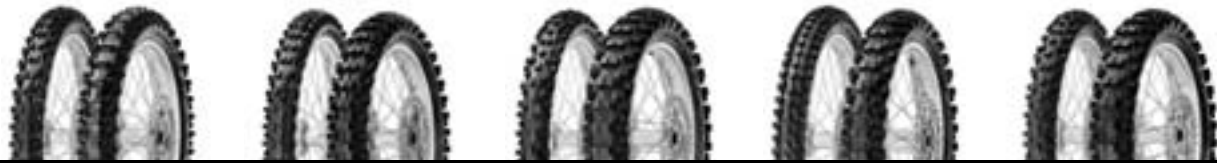
SCORPION MX SOFT 410 SCORPION MX MID SOFT 32 - MUD SCORPION MX MID HARD 454 SCORPION MX HARD 486 SCORPION MX EXTRA