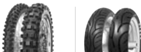
MT 16 GARACROSS GTS 23 / 24